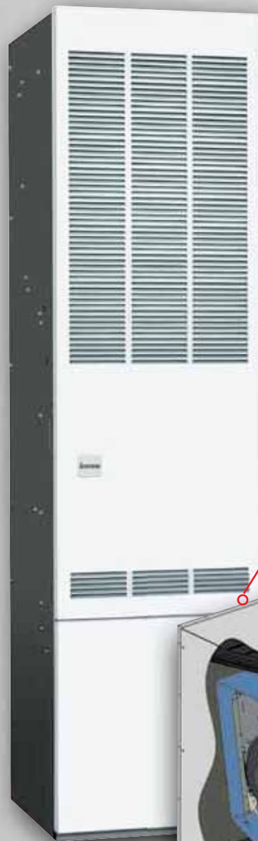
Models M1 and M5